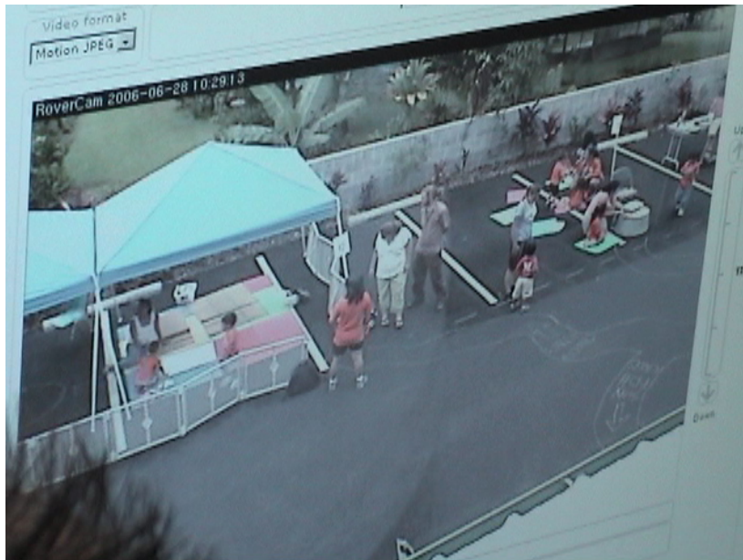
Children look at their friends outside the building.